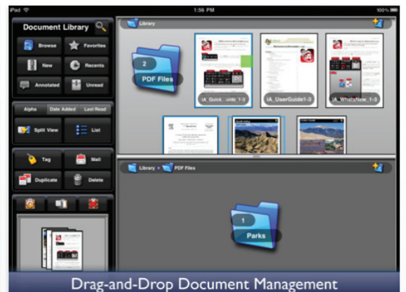
Drag-and-Drop Document Management

NOTE: This program will allow on the fly mark up of PDF proofs (First or Final) in front of an advertiser that can then be email back to production before even leaving the clients office.